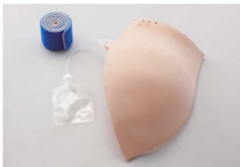
Being compact, the device needs a small space for storage.

Selection of an incorrect site is indicated by blinking of the red lamp and buzzing. Successful puncturing at the correct site is indicated by the green lamp. (Only at Clarke's point and Hochstetter's point)