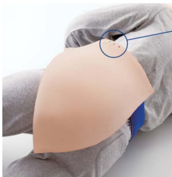
The epidermis is made of a special material that leaves no needle mark.