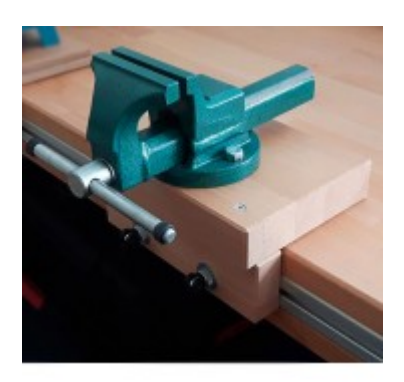
Pad with metal vise