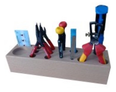
Tool kit - electronics