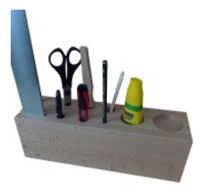
Tool kit - paper