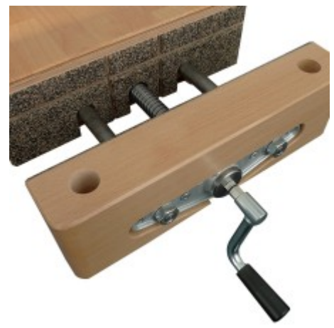
VarioGrip insert - a counterpart to the jaw