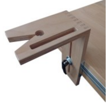
For scroll saw cutting