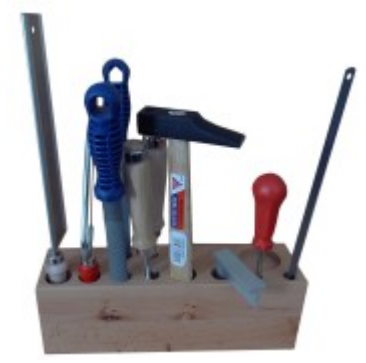
Tool kit - wood